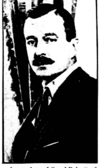
Latest photo of Grand Duke Cyril of Russia, who recently startled Paris by proclaiming his right to the throne of Russia. The duke has lived in France since the death of the czar.