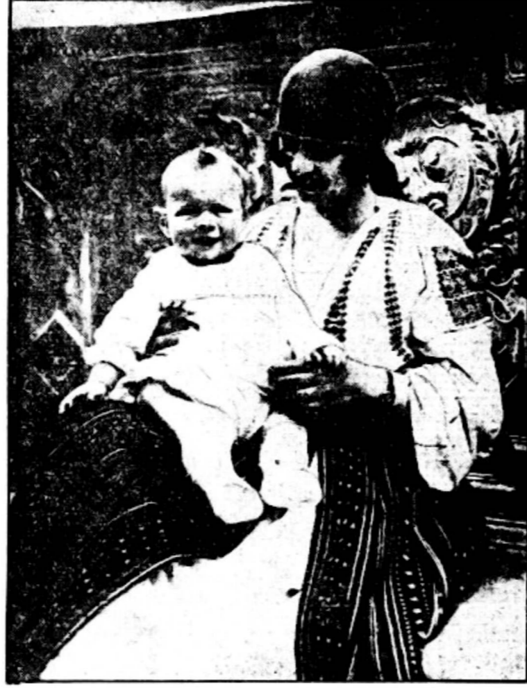
Princess Helene of Rumania and her son Michael. The latter is one of the long line of heirs to the throne of his country. Photo taken in park of Chateau Palech at Sinsia, Rumania's summer social center.