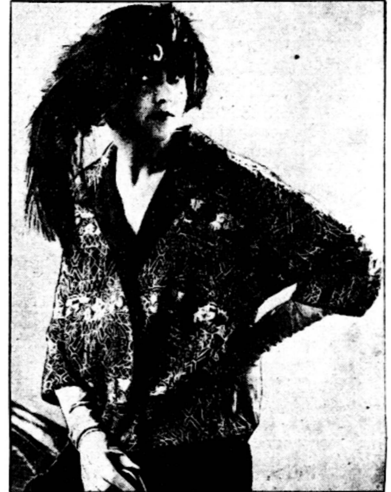
This is of special interest to woman readers, for the newest and smartest accessory to the wardrobe is the matelasse jacket. The one pictured is of black and white, and the black hat has exceptional charm.