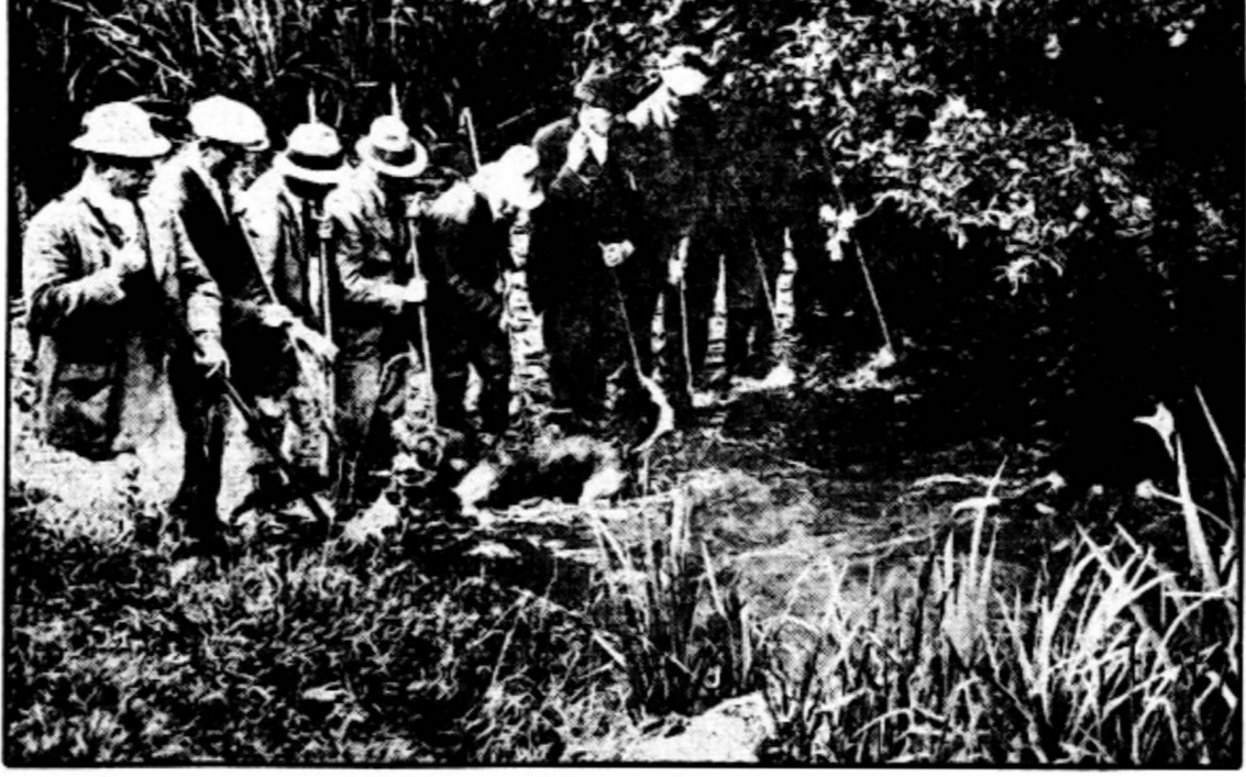
The otter hounds are on the scent in England and the season of autumn sports has opened. Photo shows meet of Crowhurst hounds at Birtley farms, Bramley, and the hunters are forming a "stickle" to prevent the otter from going down the stream.