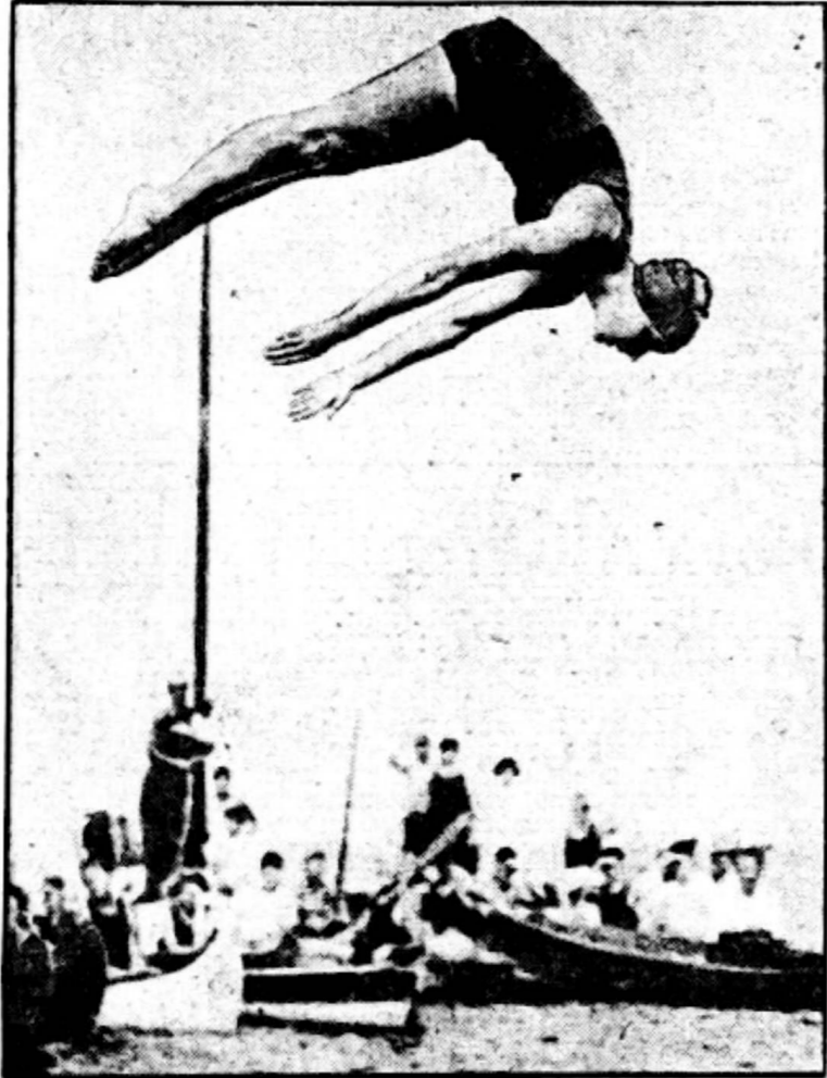
Miss Aileen Riggins, Olympic diving champion, displays her ability at the aquatic carnival of the Huguenot Boat Club, New Rochelle, N. Y., with a jack-knife dive.