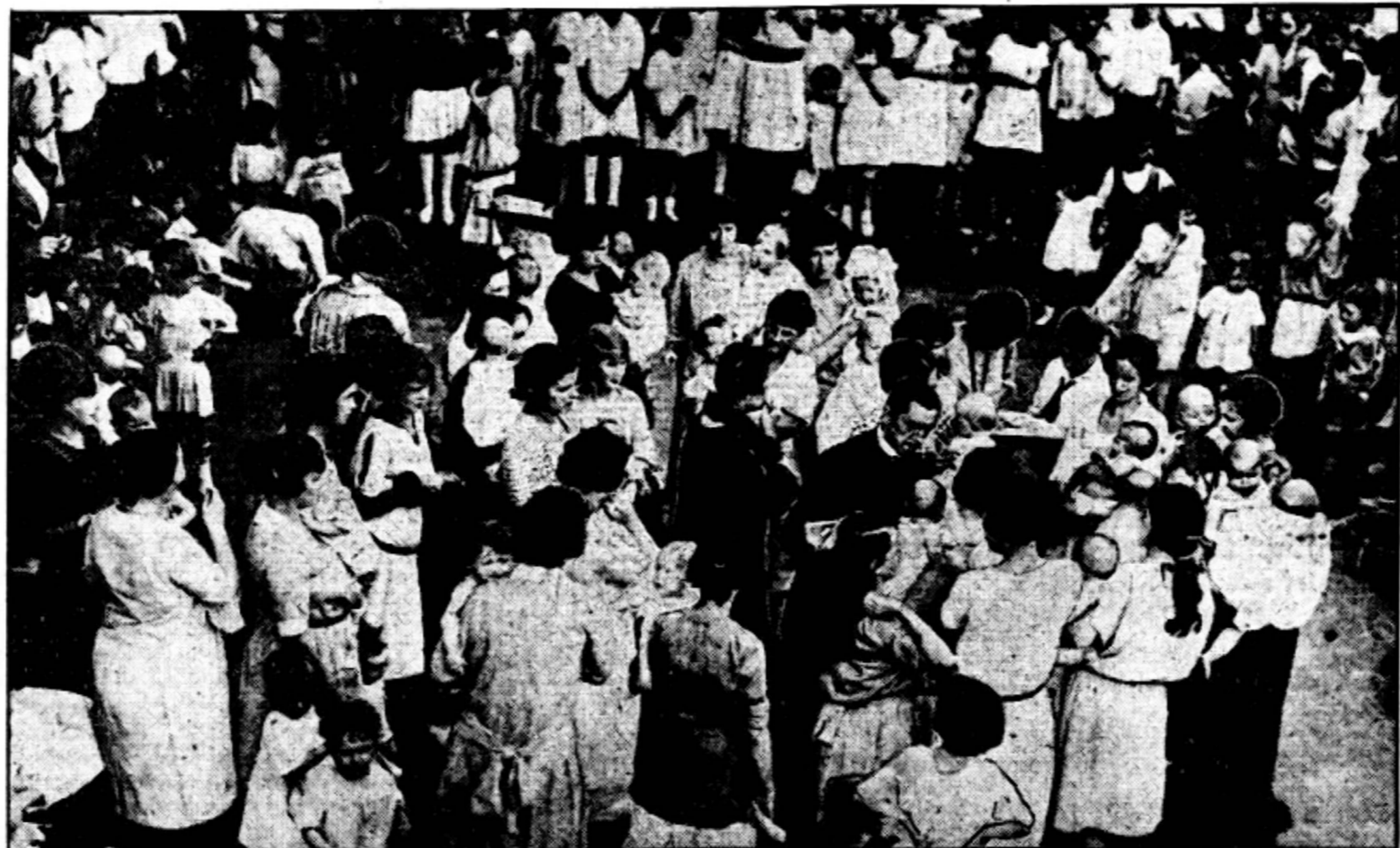
Babies to the right of them; babies to the left of them!—and how would you like to be a judge in a baby contest? Would you back up your decisions with force, if necessary? This photo of the judging was made yesterday at the Georgetown playgrounds.