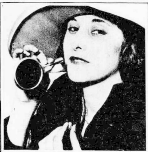
"MIRRORS OF WASHINGTON" aren't in it with this mirror from California—it's quite the dernier cry with feminine members of the pseudo smart set on the Coast—and for why? Whisper—the hollow handle of this silver pick-me-up holds just enough for a single appetizer. International.